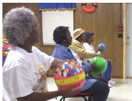
Adding some excitement to chair aerobics class with exercise balls

In March, their walking club led a walk-a-thon for 30 people during the Black Church Week of Prayer for the Healing of AIDS. During Vacation Bible School in June, physical activity