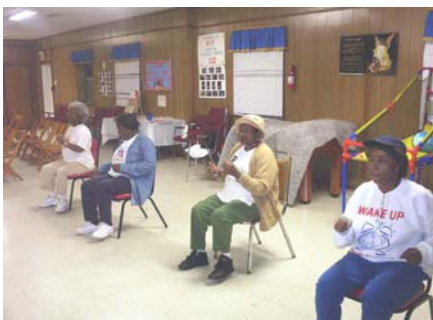
St. Stephen AME members getting Physical-e-Fit with chair aerobics