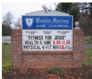
A warm welcome from Poplar Springs AME in Laurens

The Health-e-AME Physical-e-Fit program is heading into the 3rd year of existence and has been offered to churches across the state!